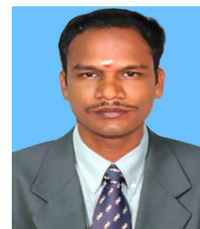
Nodal Officer - PMSSS